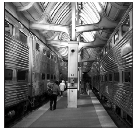
Below: Mass transit systems in Chicago, like the Metra trains lets commuters travel from suburbs to the city with ease!

resolution calls for a .5 percent tax cap for roads and .5 percent for transit. Although transit groups figured that including roads and setting a .5 percent cap would make the measure more palatable, Speaker of the House Rep. Craig DeRoche (R-Novi) declared he would not allow passage of the resolution. Unfortunately, this shows the majority leadership to be anti-transit as well as uninterested in giving citizens the democratic opportunity to vote on the issue.