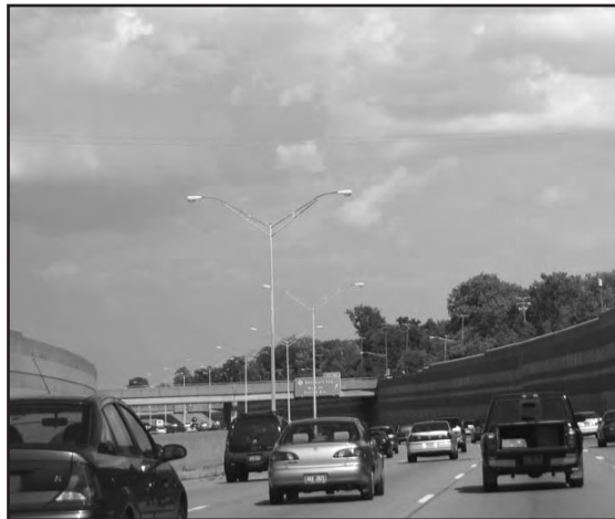
Left: Traffic on 696-Eastbound on a regular day. With higher gas prices, will we be able to come up with a better solution for all of this?