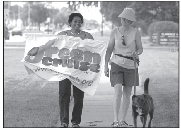
A couple of ladies and their dog having a good time and showing support at last year's Green Cruise event!

While it may seem that green transportation is an idea that is easier said than done, it in fact is simply a great way to finally get off the couch and go outside for some exercise, and attending the Green Cruise is a great way to start. Just think about the all benefits of a whole afternoon's worth of exercise, and