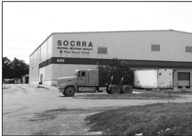
Above: The recycling SOCRRA plant is located in Royal Oak, between 14 Mile Road and 15 Mile Road. The facility processes approximately 16,000 tons each year from about 100,000 homes.

The SOCRRA facility, built in 1992 at a cost of $2.3 million, was set up as partial solution to the closing of the Madison Heights SOCRRA incinerator (which was strenuously and ultimately successfully opposed by environmental groups including SEMG). Currently, SOCRRA charges its twelve member communities $37.50/ton of recyclable material. This seems high when compared to local landfill tipping fees in the $11 – $17/