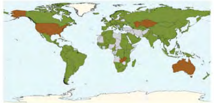
Signatories to the Kyoto Protocol, June 2005

Kyoto Protocol status Ratified Signed only Not signatory No data