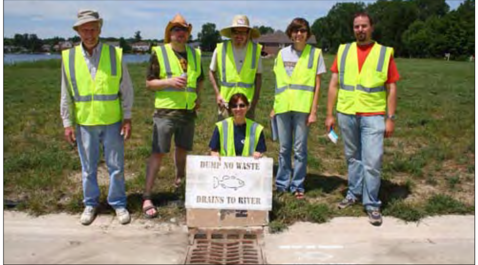
Rochester Ecos

Pointe and at the Public Library in Orion; monitored water quality in two local Clinton River sites in Pontiac and Rochester Hills as part of CRWC's Adopt-A-Stream program (four of our members got Bug ID certified too!);