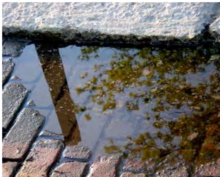
Escher-like reflection of a smokestack in a Traverse City, MI puddle.

The bi-weekly curbside recycling program involves single stream recycling in which all materials (glass, plastic, tin cans, paper,) can be co-mingled in the same bin, and items that are hard to recycle will be carted along with