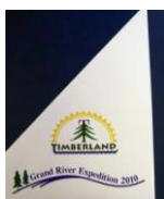
Pennant side 1

Mail address: Trailspotters of Michigan, ATT: GRE2010, P.O. Box 332, Cloverdale MI 49035