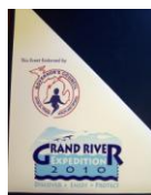
Pennant side 2